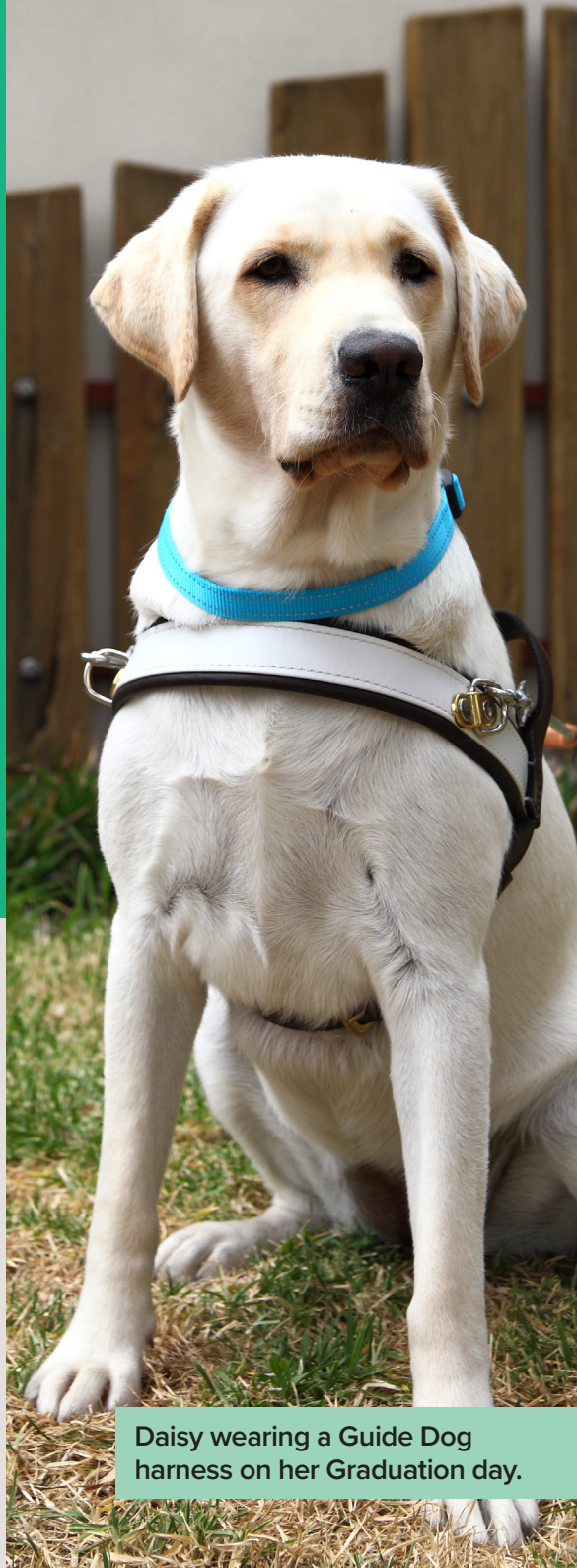
Daisy wearing a Guide Dog harness on her Graduation day.