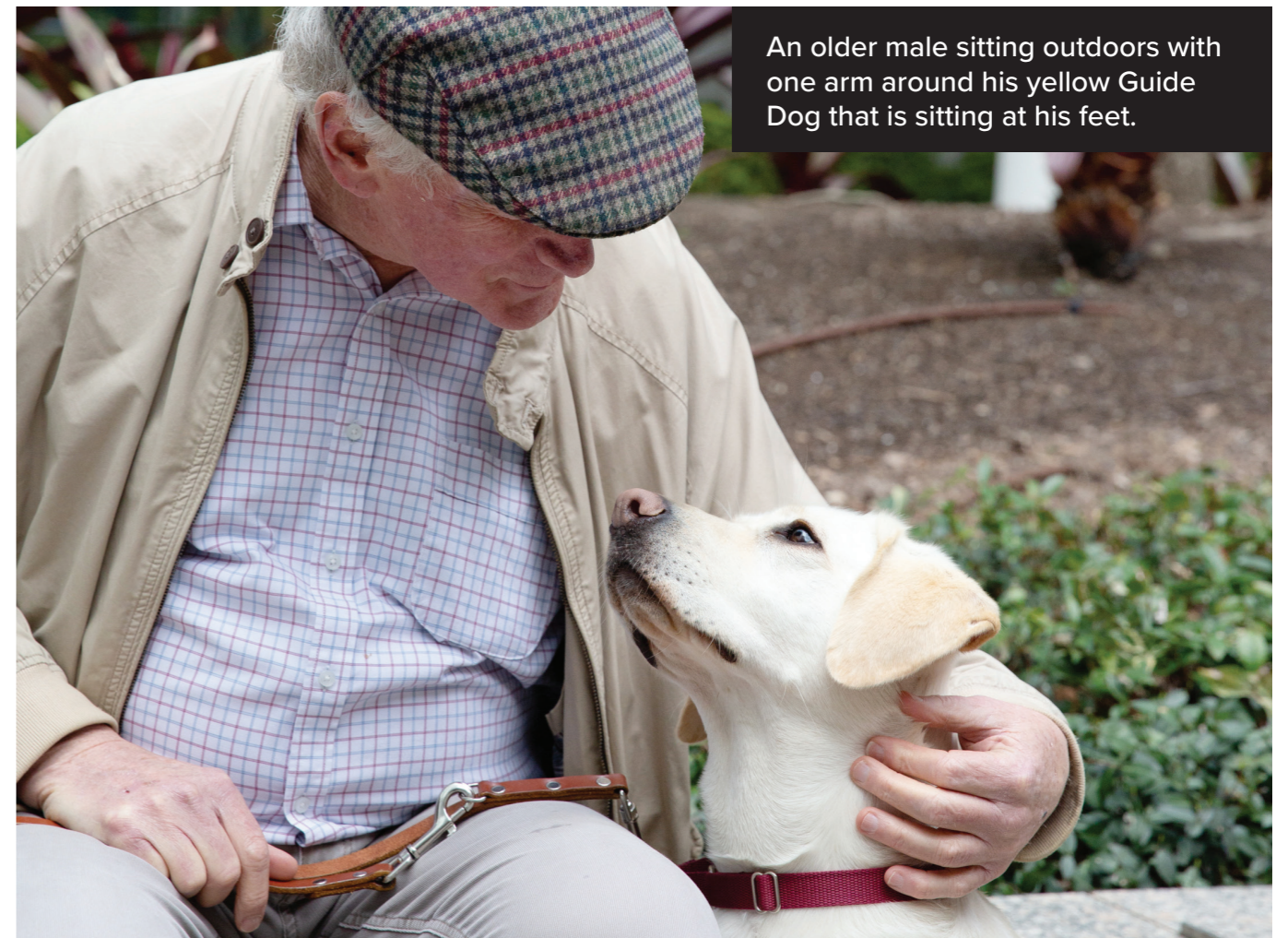
An older male sitting outdoors with one arm around his yellow Guide Dog that is sitting at his feet.

We encourage you to be realistic with your target but ambitious too; communities love to come together and get involved!