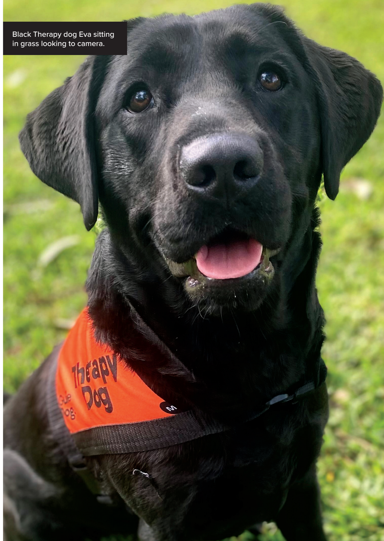
Black Therapy dog Eva sitting in grass looking to camera.