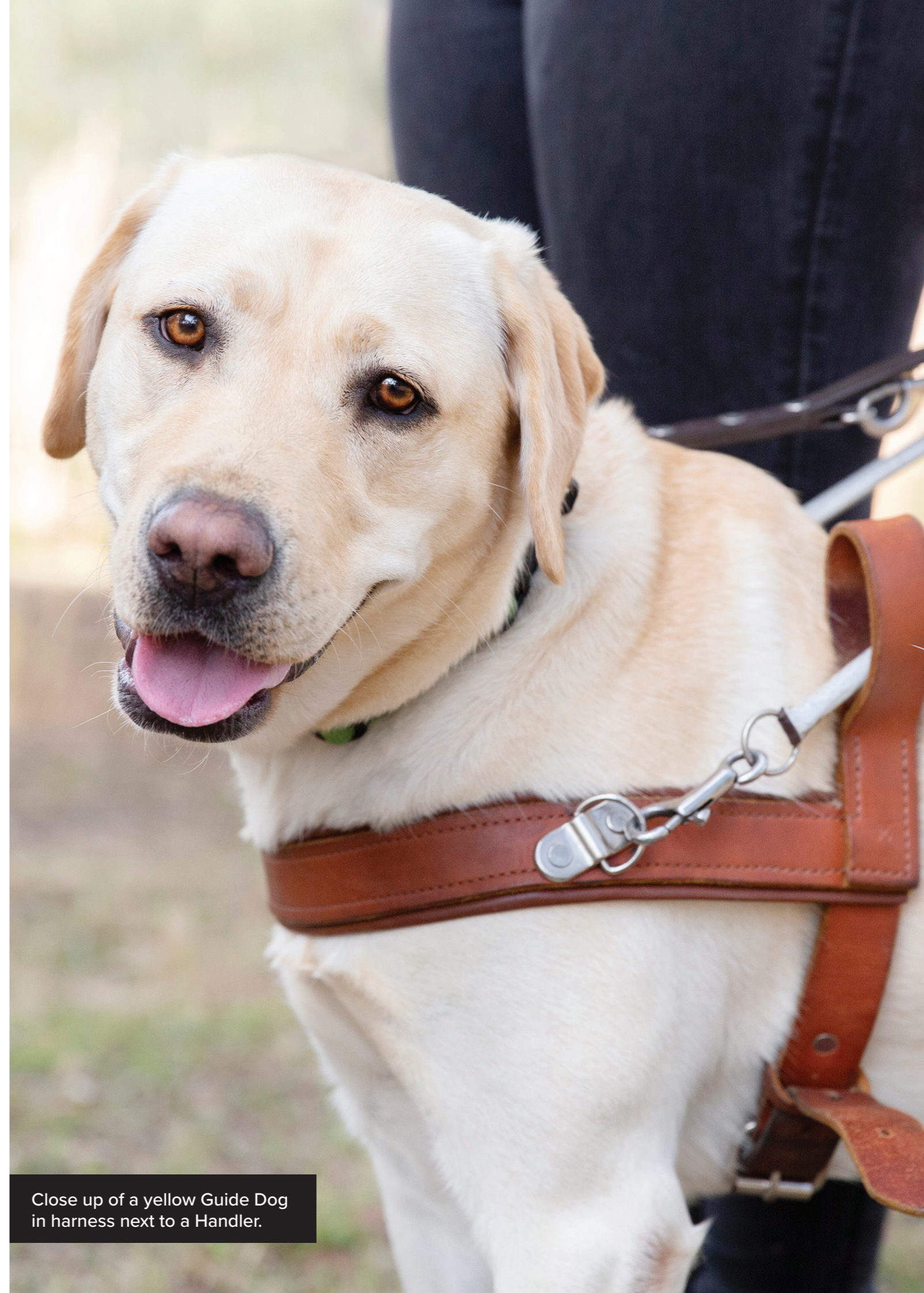
Close up of a yellow Guide Dog in harness next to a Handler.