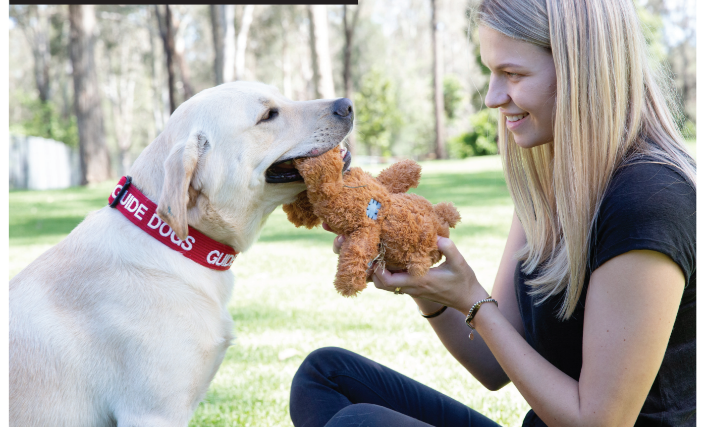
Guide Dogs staff member sitting on the grass offering a Guide Dog in training a KONG toy.

For more information please visit fundraising.guidedogsvictoria.com.au or for assistance setting up an online page, or to get in touch with the team, email fundraising@guidedogsvictoria.com.au