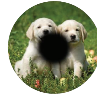
Age-related Macular Degeneration