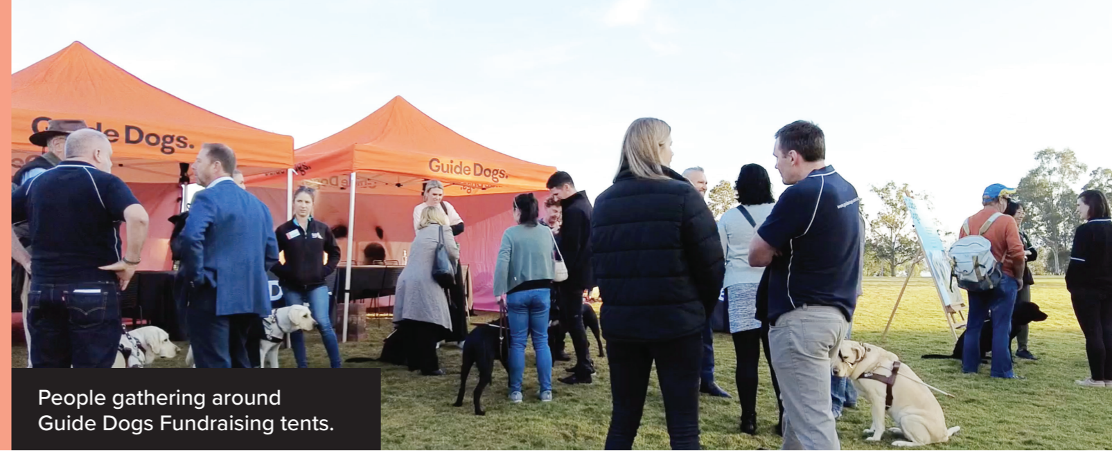
People gathering around Guide Dogs Fundraising tents.

Ask: If you want to raise money, you need to ask! Don't be shy, reach out to your networks – you might just be surprised by people's generosity!