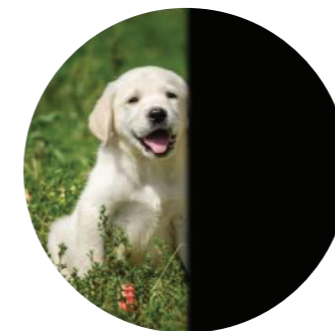
Neurological Vision Impairment (Acquired Brain Injury)