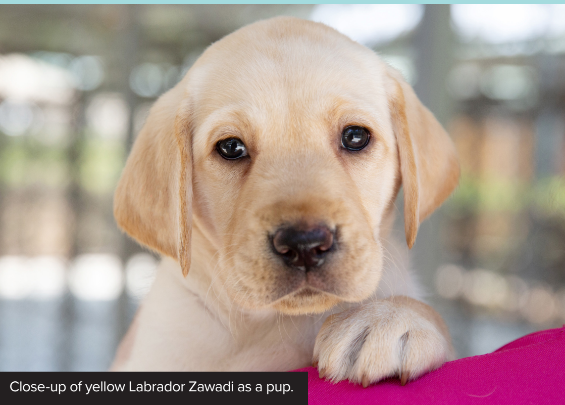
Close-up of yellow Labrador Zawadi as a pup.

Become a Guide Dog Partner and give independence to Australians with low vision or blindness.