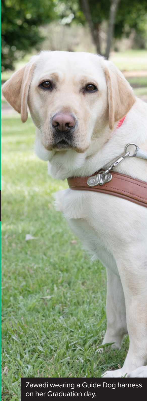
Zawadi wearing a Guide Dog harness on her Graduation day.