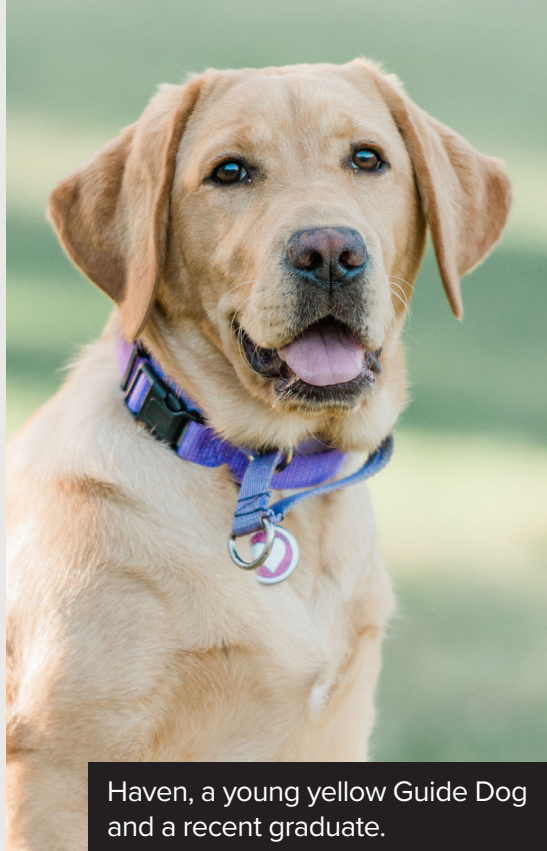
Haven, a young yellow Guide Dog and a recent graduate.

Because of supporters just like you, we have more than 280 hardworking Guide Dogs and 380 dogs undertaking various other vital roles out in our community at any one time, and our Guide Dog Program is constantly growing. By joining our community of dedicated supporters, you too can walk side-by-side through the journey of breeding, raising and training our iconic pups. We are so appreciative of your kindness as you consider becoming a Guide Dog Partner and helping us continue to achieve successful outcomes for those living with low vision or blindness.