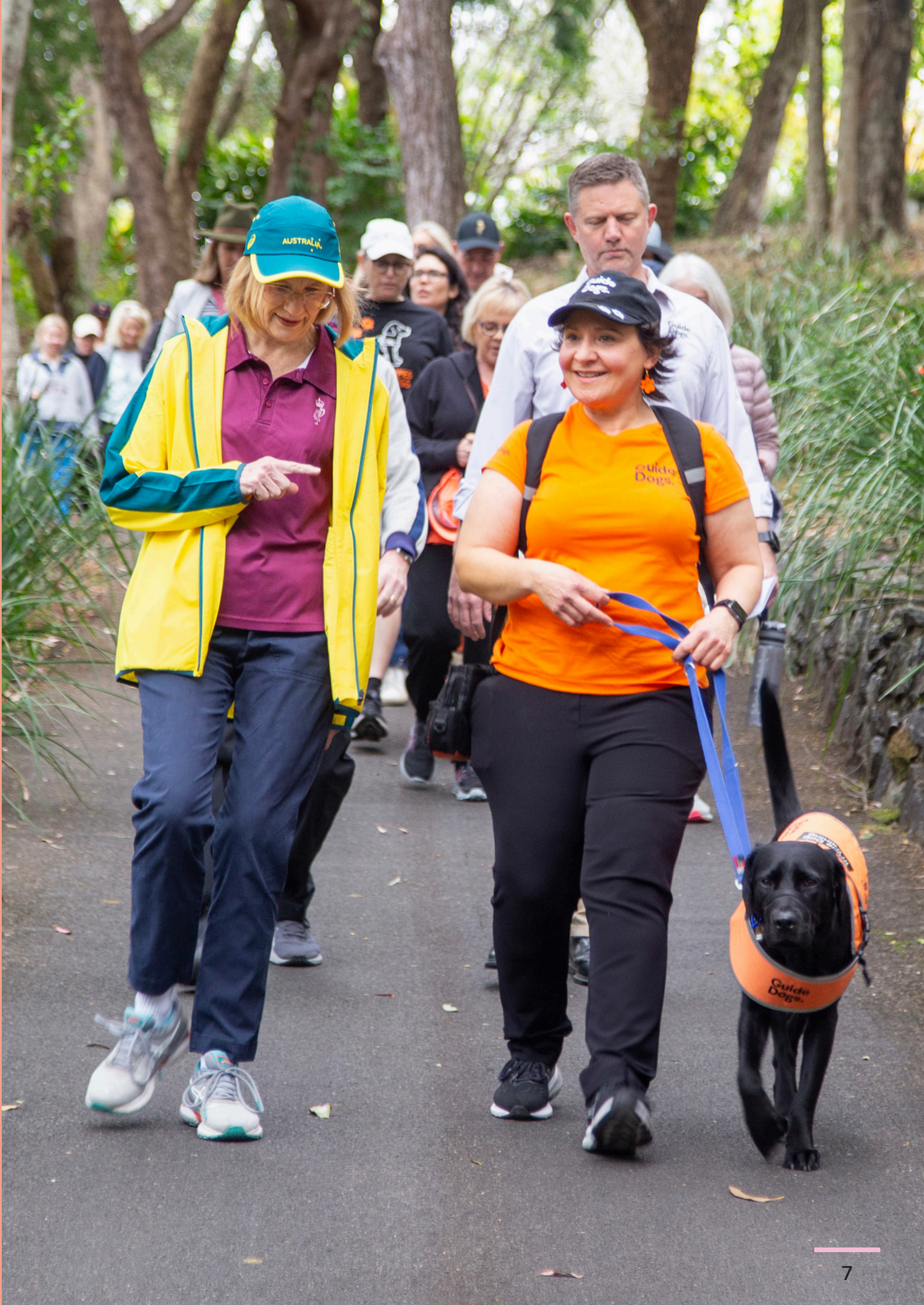
Her Excellency the Honourable Dr Jeannette Young AC PSM Governor of Queensland

A handwritten signature in black ink, reading "Jeannette Young".