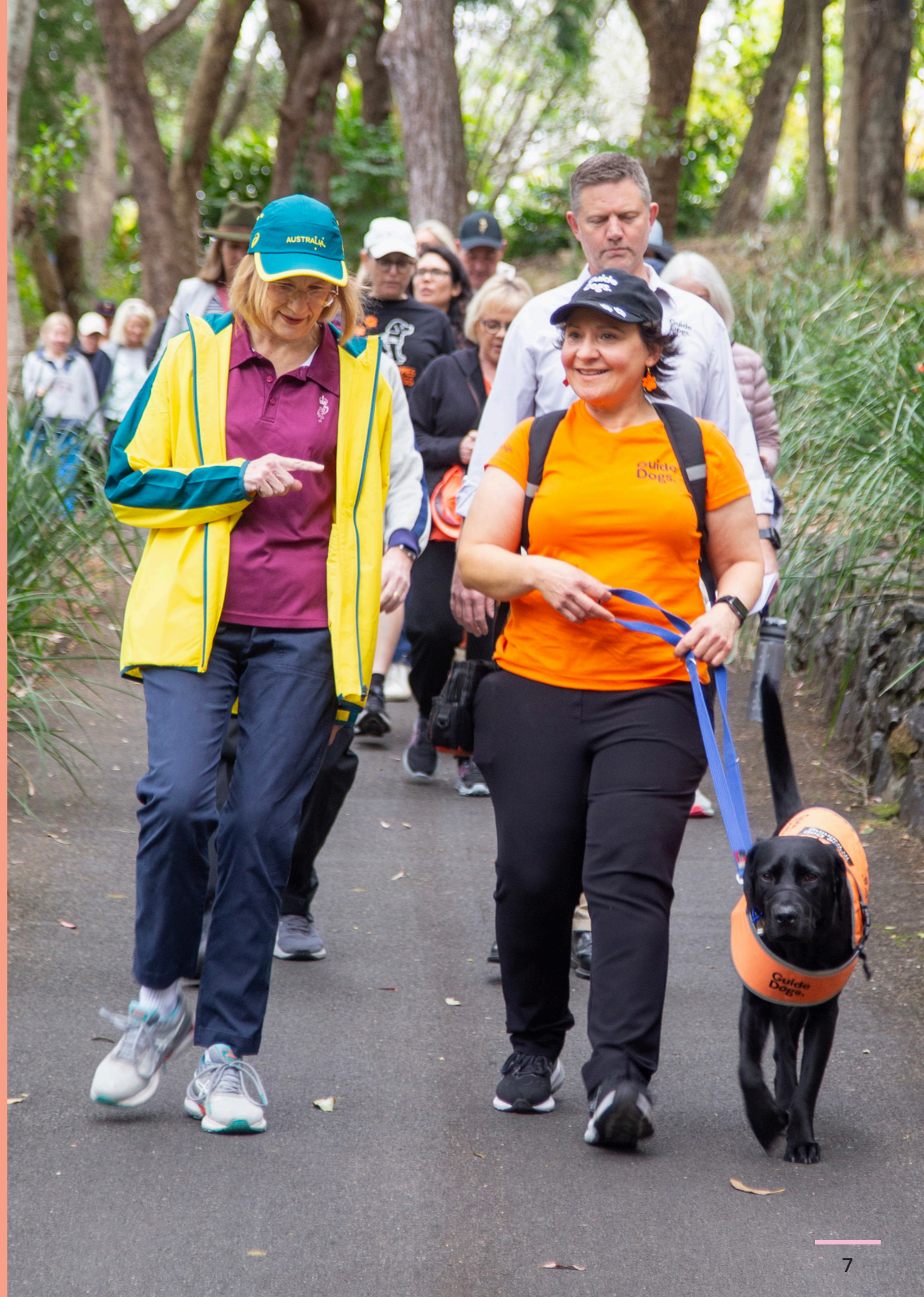
Her Excellency the Honourable Dr Jeannette Young AC PSM Governor of Queensland

We owe Guide Dogs Queensland a debt of gratitude, and I offer mine on behalf of all Queenslanders.